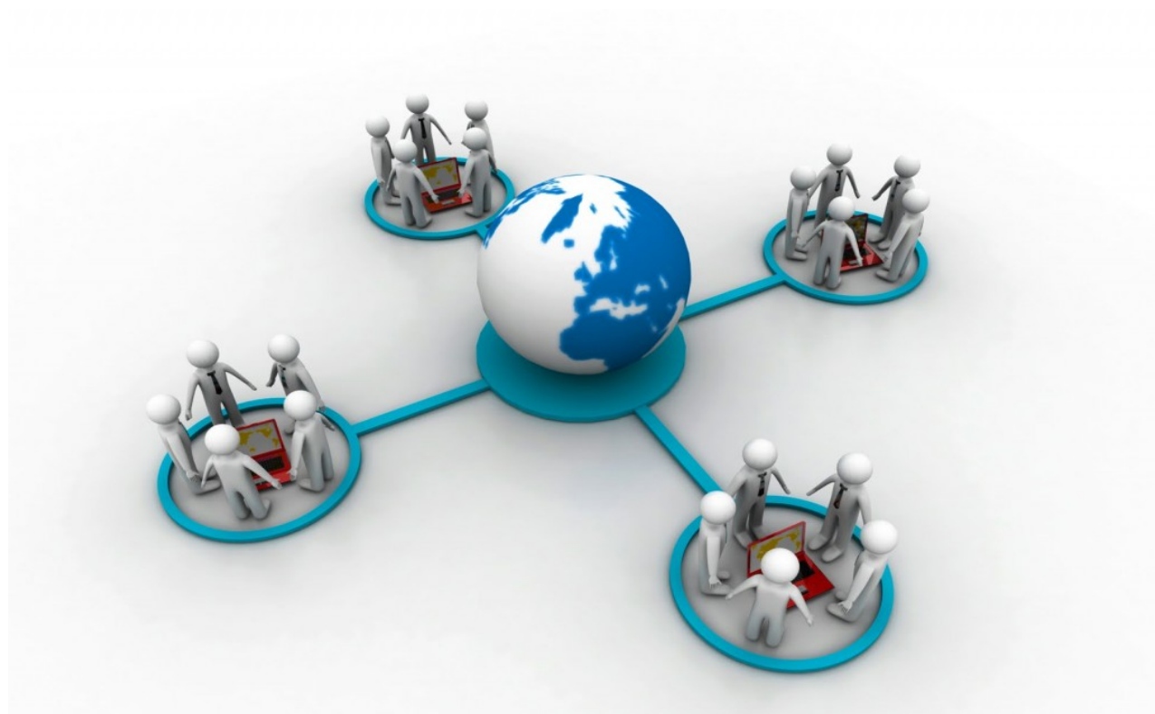
[Figure-2 Distributed Teams]